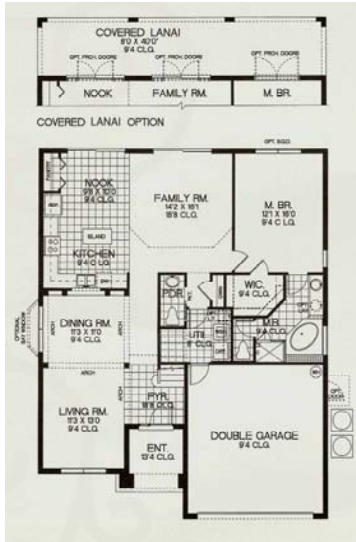
First floor of our house